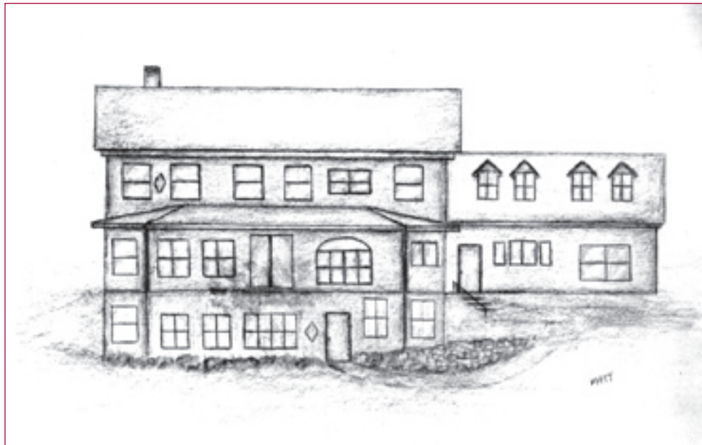
Artist's sketch of Heartbeet's second house.

What do we need now? We need your support to make this a reality!