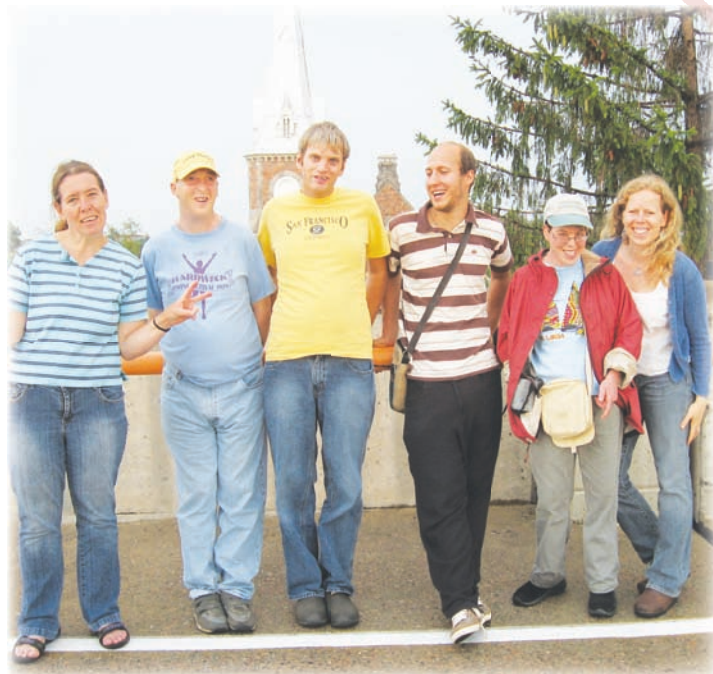
Welcome the new crew 2008-2009.