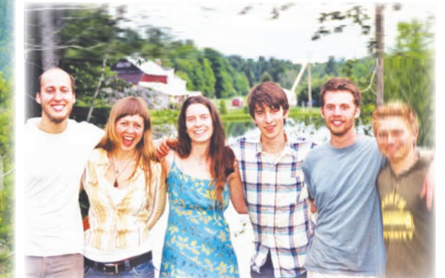
Thank you to the old crew 2007-2008.