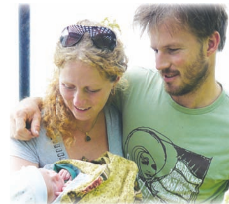
Welcoming new nephew.