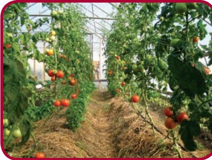
Welcome to the Jungle

What a summer! We accomplished pulling down the old barn, building a new one (with some things still left to do), and we enjoyed an amazing open house and our first Family Weekend. Mixed into the big projects we all found plenty of time for swimming, playing, going to baseball games, picking berries, camp fires, making music, and enjoying each other's company in both work and play. An early spring blessed us with the possibility to jump start