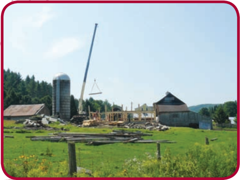
Raising The Barn

our agricultural season in our new greenhouse that we fired up in early May. We were eating wonderful greens -- kale, chard and spinach -- much earlier than we ever have. June brought with it many a rainy day but the shelter of our greenhouse provided a wonderful working environment: starting seeds and developing raised beds to host our tomatoes, basil, and salad. By June 10th the greenhouse was a jungle of growth, giving hope to those of us that didn't believe that summer would really get here.