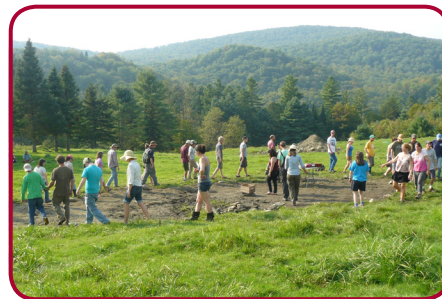
Site of Heartbeet's future Hall