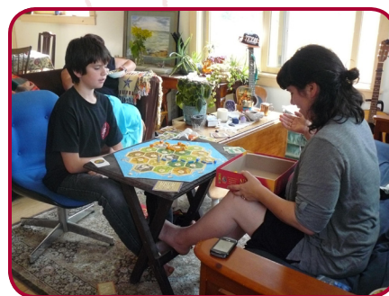
Wilde & Sen take game break