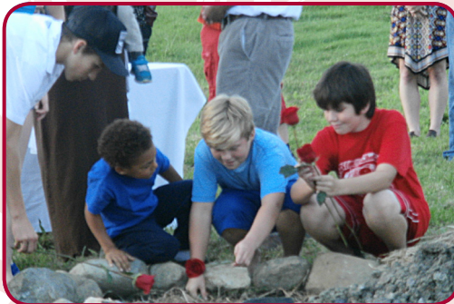
Children laying roses