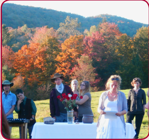
Groundbreaking for Hall