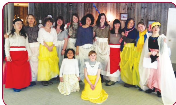
Shakespeare meets Fasching.