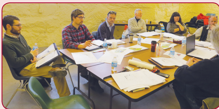
Building Team working with our architects.