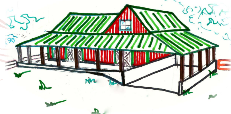
The Heartbeet Barn with Additions.

have plans to re-establish the foundation and have collectively envisioned and approved the design of two new additions on our barn to meet the needs of the growing community. Community members have rallied in support of caring for the barn and are excited to increase its size and thereby improve animal housing and productivity in our daily work. Construction is scheduled to begin June 2014. We welcome anyone and everyone who wishes to open a new doorway to discovery: a place of honest work, friendship and understanding and an opportunity to cultivate a genuine love for the Heartbeet Barn...for many years to come!