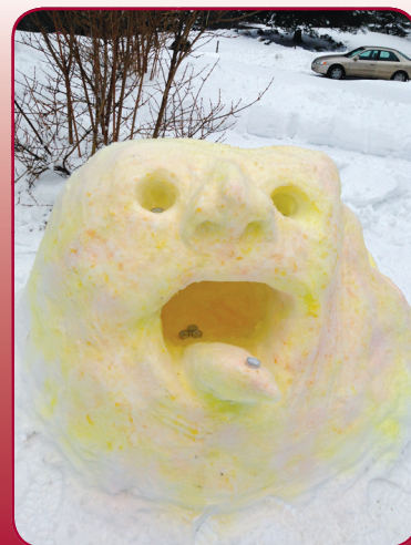
Celebrating Candlemas . . . and the Winter that just wouldn't end!