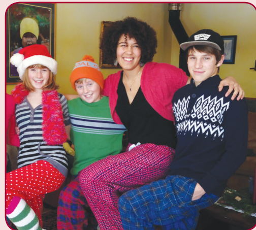
Schwartz-Gilbert kids ham it up.