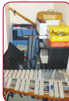
Crowded instrument storage!