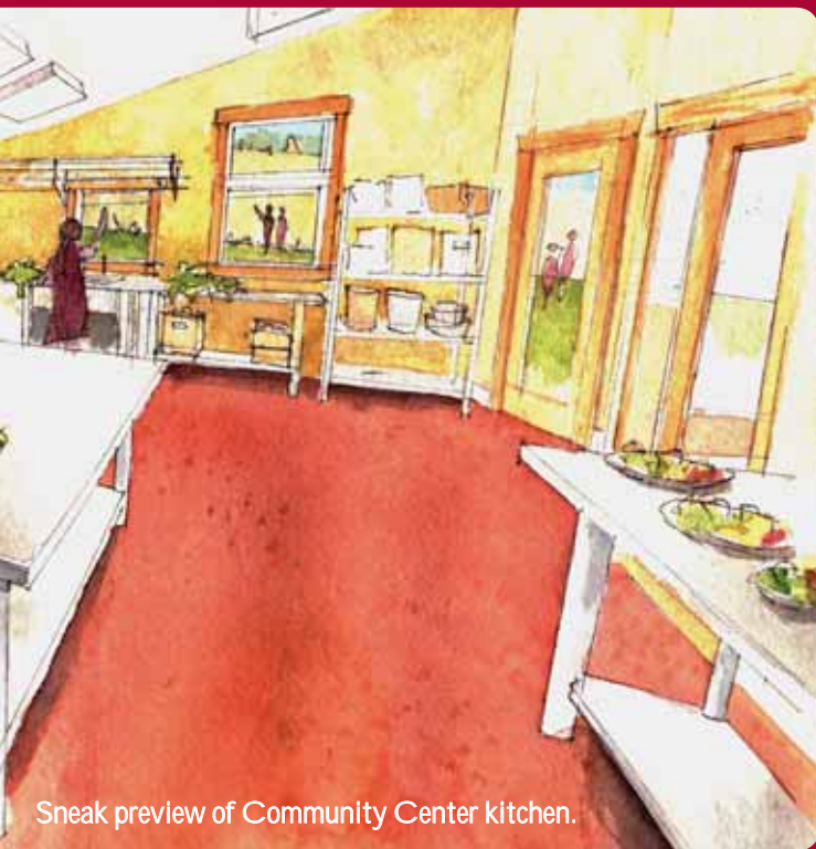
Sneak preview of Community Center kitchen.