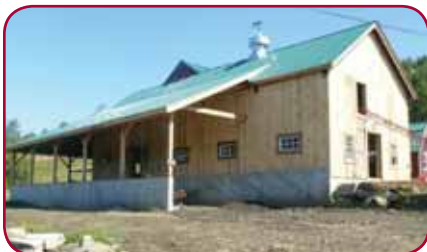
Thanks to donors who made the barn renovation possible!

Heartbeet members also took time to support the international Camphill