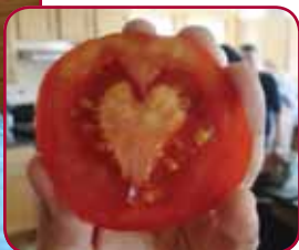
A lot of love goes into our garden produce!