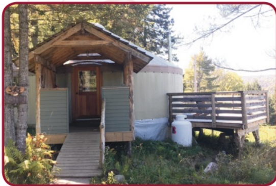
Entrance to Aster Yurt

Thanks to a very generous anonymous donor who started the Matching Gift campaign, the plans to renovate the Pool House at Heartbeet Hill are moving forward. It will have the potential to offer accommodations for family, coworkers and guests of our community.