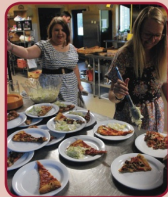
Pizza & Movie Night!