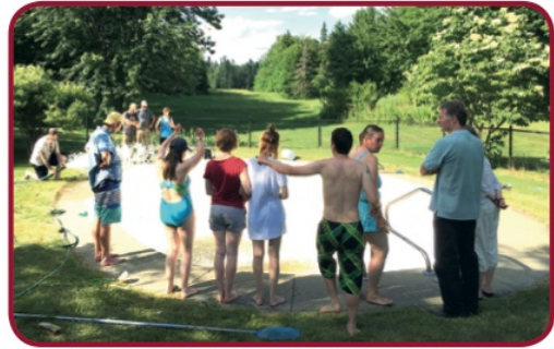
Fun times at the pool!