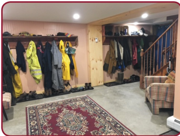
The New White Pine Boot Room

The first floor support beams (joist) had to be lifted and redone under the kitchen and dining room. There was a bathroom in the kitchen which is now a pantry. Everywhere you turn there are beautifully colored walls awaiting art work. The drafty glass door in the sun room has been replaced and will keep everyone toasty during the winter months. The original wood floors have been refinished, shower tiles replaced and a hot water baseboard system has been added with six different zones throughout the house to bring energy efficiency.